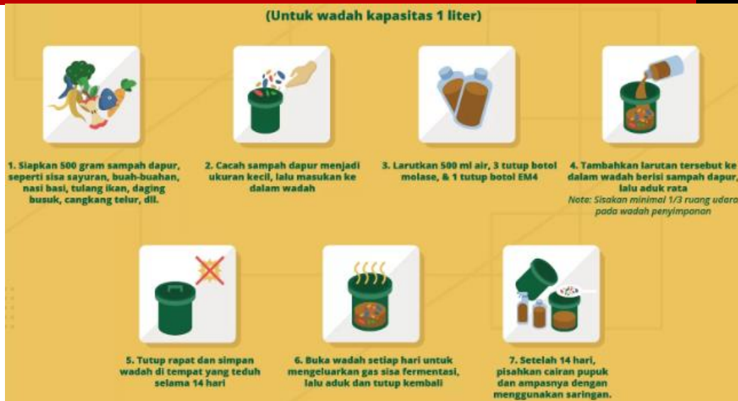
Figure 4. Stages Of Making Liquid Organic Nutrition