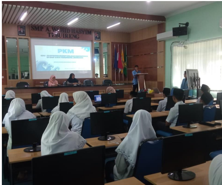
Figure 2. Activities During Training

In the second material, a discussion lecture on hydroponic vegetable cultivation was given after the service participants knew the urgency of ecopreneurship. One form of ecopreneurship carried out in this service is hydroponics and the types of plants that are cultivated are vegetables. Hydroponics was chosen because this method has many advantages, including a medium that does not require a large area of land, is easy, can use waste into a useful medium, and most importantly the crop yields can also be optimal (Praag, C. M. and Cramer, 2022). The vegetables that will be practiced are pokcoy vegetables. This is because pokcoy is a type of nutrient-rich vegetable that is liked by many Indonesian people. Planting it hydroponically is very easy and doesn't take a long time.