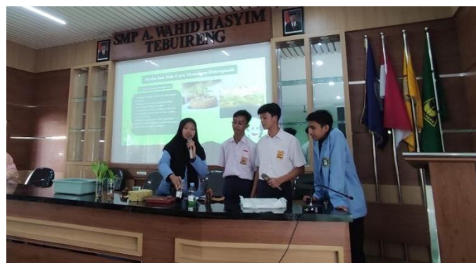
Figure 5. Active and Enthusiastic Participants in Individual Hydroponic Practice

At the maintenance stage of hydroponic cultivation and sales of hydroponic cultivation products, monitoring is carried out via the Instagram social media page. The service team distributed a hydroponic set that had started to grow to 10 students who were then looked after at home and monitored the results via social media. Students who successfully carry out treatment will receive rewards from the service. Meanwhile, the sales stage has not been carried out optimally considering the small harvest. The following is Figure 5. of the participants who are active and enthusiastic in carrying out the individual practice stages of hydroponic cultivation at home: